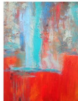
These two pieces show the various styles of Jimmy Tablante